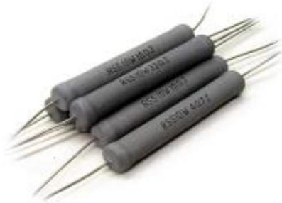
10 Watt - 5%