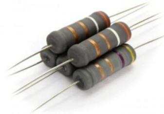
5 Watt - 5%